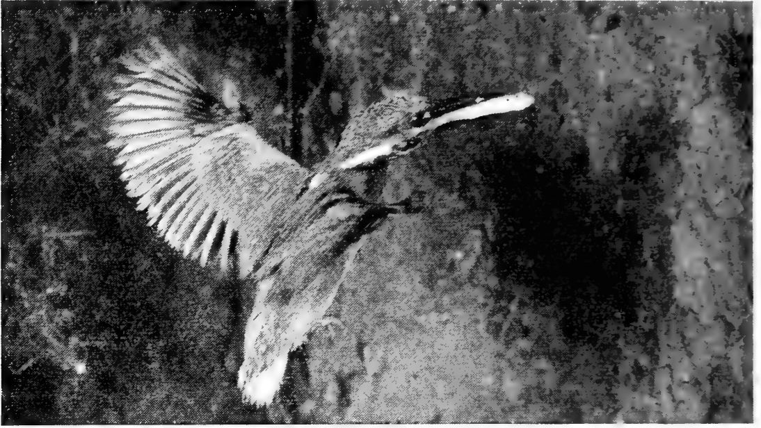
Kingfisher